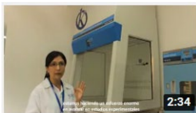
Kalstein France - Jacinto Convit Foundation / Allianc... 23 views • 3 years ago