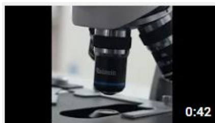
Kalstein's Microscopes 445 views • 1 week ago