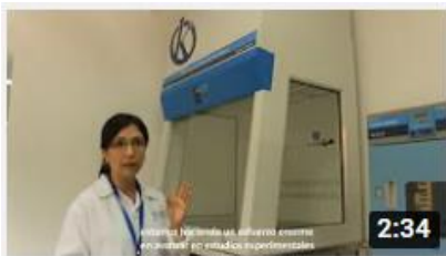
Kalstein France - Jacinto Convit Foundation / Allianc...