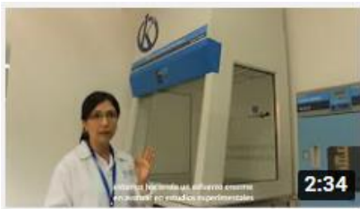
Kalstein France - Jacinto Convit Foundation / Alliances 23 views • 3 years ago