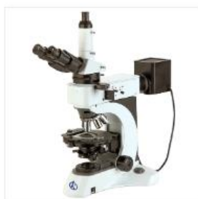
Polarizing microscope YR0263