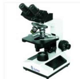
Binocular Biological Microscope for Students