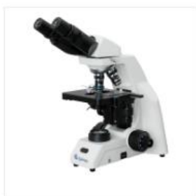
Laboratory Microscope YR0239 – YR0240

Catalog of models of Microscopes on offer