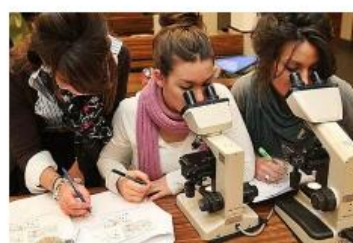
Microscope: Halogen vs. Illumination leds