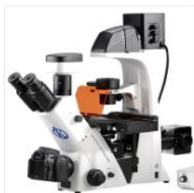
Inverted Fluorescent LED Microscope YR057