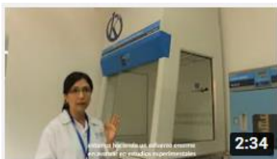
Kalstein France - Jacinto Convit Foundation / Alliances