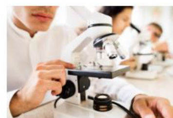
What is a fluorescence microscope?