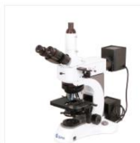
Metallurgical microscope YR0255