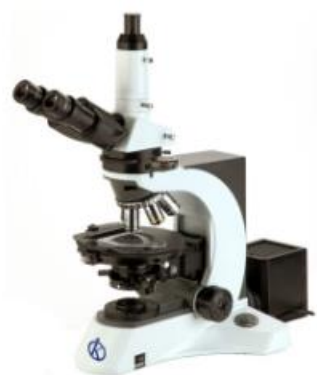
Polarizing microscope YR0261