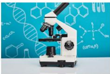
What is an Atomic Force Microscope?