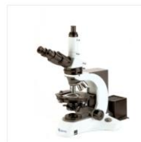
YR0261 Polarizing Microscope