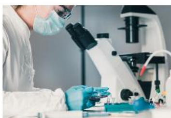
What is an X-Ray Microscope?