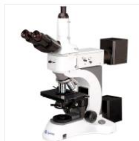
Metallurgical microscope YR0251 – YR0252