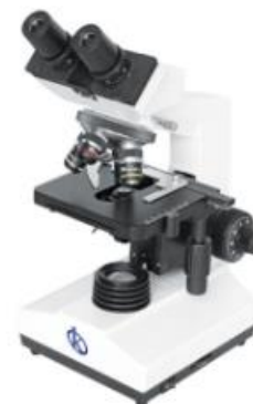
Binocular microscope YR0242