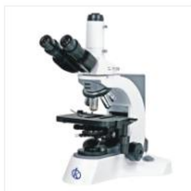
Trinocular microscope YR0231