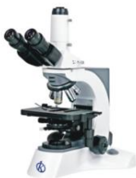
Trinocular microscope YR0231