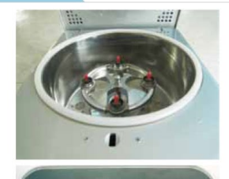
Put PRP kit into the rotor