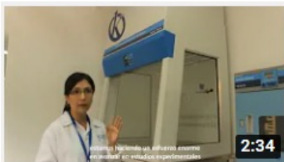
Kalstein France - Jacinto Convit Foundation / Alliances 23 views • 3 years ago